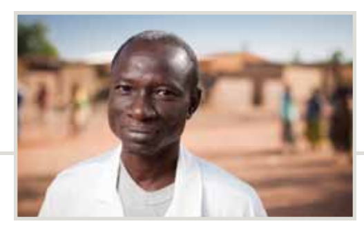
Researchers are closer than ever before to developing groundbreaking health technologies that can have an immediate impact and save lives worldwide.

This report offers ways for US policymakers to accelerate scientific innovation and facilitate the rapid introduction of safe, effective, and affordable new health technologies. By following the actions outlined in this report, US policymakers can build on the nation's commitment to science and innovation and long tradition of leadership in these areas, helping to ensure that the next generation of global health tools reaches those most in need.