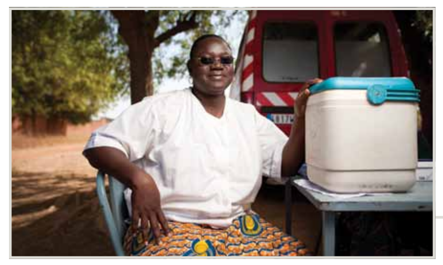
US investments in research have contributed to breakthroughs in global health. For example, this nurse in Burkina Faso has a cooler full of lifesaving vaccines that were developed with US support.

This second annual policy report from the GHTC—a group of almost 40 nonprofit organizations working to increase awareness of the urgent need for vaccines, diagnostics, drugs, microbicides, and other products that save lives in the developing world—outlines some of the action steps that will help curb unnecessary deaths, extend lives, and secure healthier futures. Serving as a guide for policymakers, the report documents promising policy actions taken over the past year in the areas of US investments in global health and international development, regulatory pathways to ensure the safety and efficacy of health tools, and incentives and innovative financing mechanisms to spur global health product development. This report offers recommendations for how US policymakers can continue to have a lead in improving health worldwide.