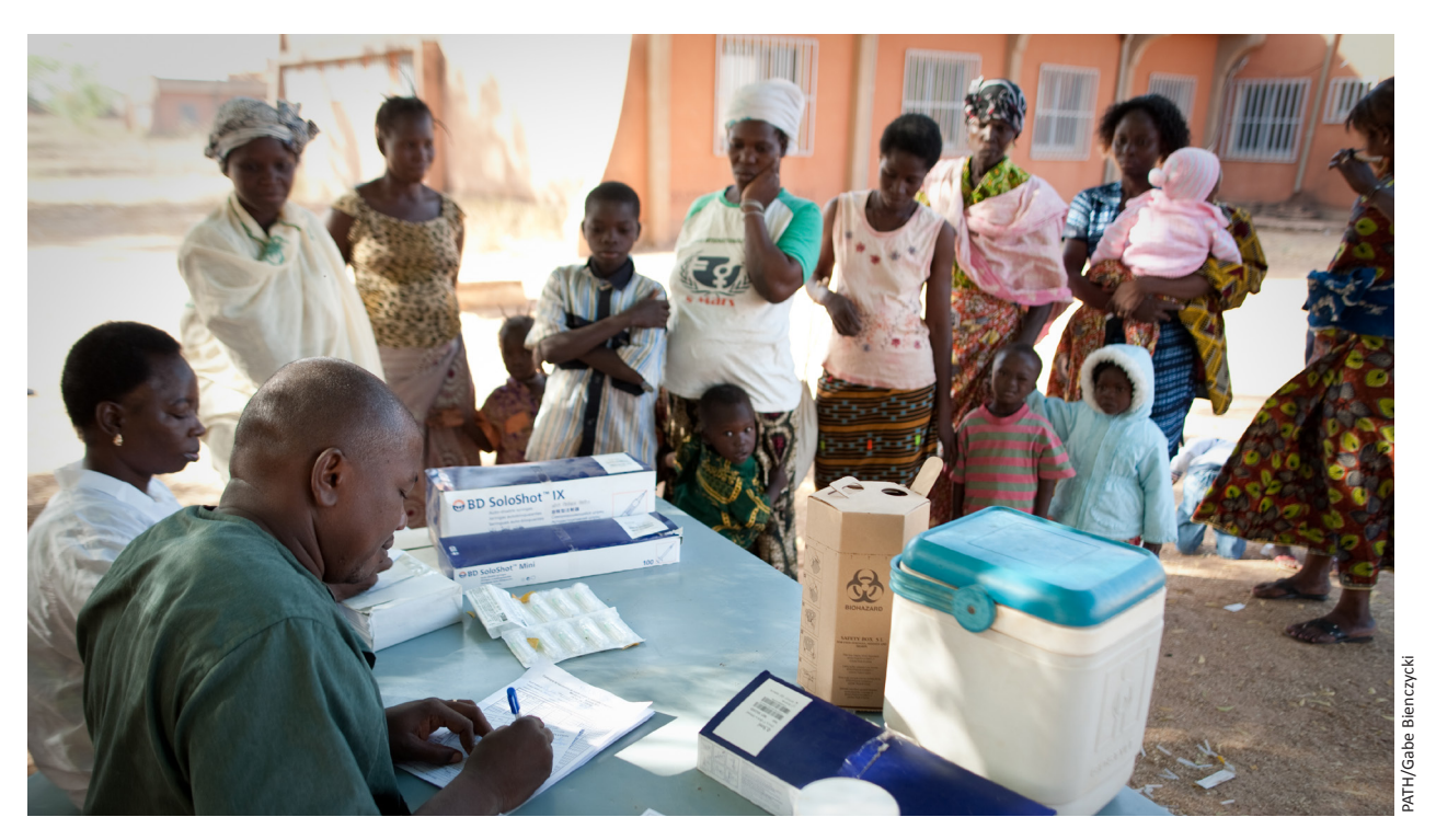
The FDA worked in conjunction with NIH and other partners to develop MenAfriVac—a low cost vaccine to prevent meningococcal meningitis.