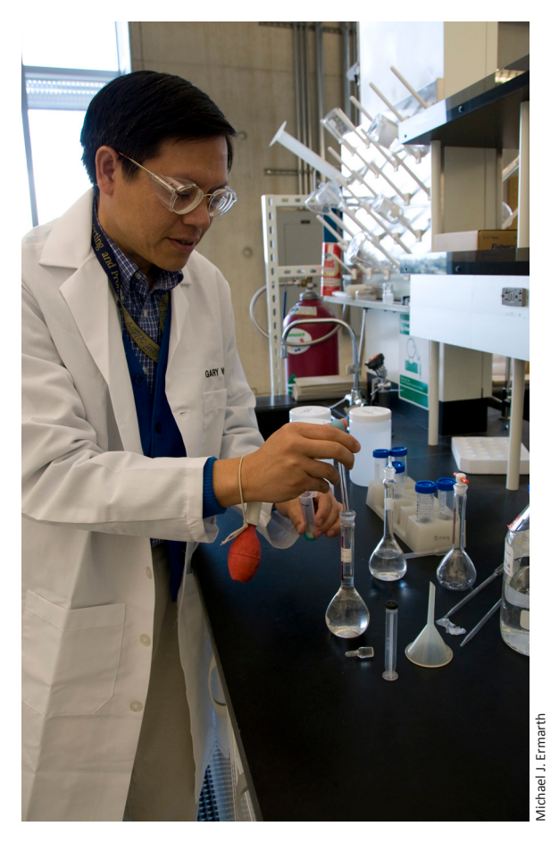
An FDA chemist prepares to test the melting point of a drug.

The FDA conducts neglected disease product review and regulation through several offices including the Center for Biologic Evaluation and Review<sup>15</sup> and the Office of International Programs.<sup>16</sup> The Center for Drug Evaluation and Research<sup>17</sup> and the Center for Devices and Radiological Health<sup>18</sup> support FDA's global presence and health systems strengthening initiatives. The FDA also funds global health R&D through the Critical Path Initiative to close the gap between early-stage biomedical research and product development.<sup>19</sup> The FDA plays a role in global health issues by ensuring the safety and effectiveness of health products that prevent, diagnose, and treat diseases that affect millions of people worldwide.