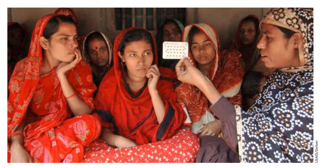
As part of its global health activities, USAID supports research to develop new contraceptive methods and improve upon existing methods.

The Office of Management and Budget has specific priorities for science and technology; however, there isn't a clear global health component. The National Security Council has a framework for national health security that is designed to achieve two goals: build community resilience and strengthen and sustain health emergency response systems. <sup>46</sup> The National Security Council was the lead in the recent Global Health Security Strategy released by the White House in early 2014. This is an interagency strategy and has a global health R&D component. The Department of State's Office of Global Health Diplomacy (GHD) coordinates with other agencies to implement global health policies. However, there is no clear R&D priority. <sup>47</sup>