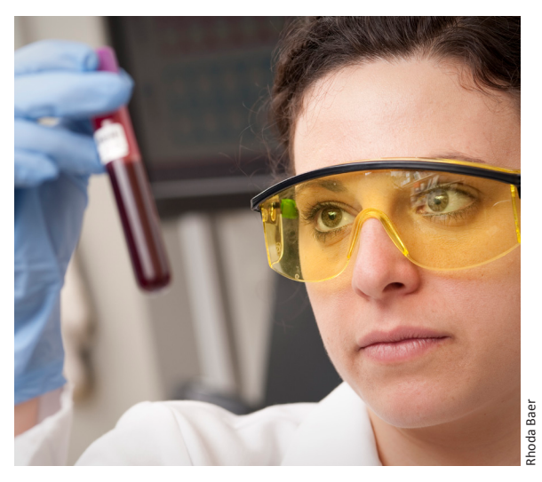
An NIH scientist examines a specimen.

NIAID, NICHD, and the National Center for Advancing Translational Sciences all identify global health R&D as a priority on their websites. The mission of NIAID is to conduct and support basic and applied research to better understand, treat, and ultimately prevent infectious and immunologic and allergic diseases. The Office of Global Health at NICHD facilitates international research and coordinates the HIV/AIDS portfolio. The National Center for Advancing Translational Sciences was established to transform the translational science process so that new treatments and cures for disease can be delivered to patients faster.