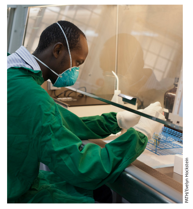
An assistant research officer at the Kenya Medical Research Institute/CDC facility prepares a sample to detect tuberculosis drug resistance.

Several agencies stressed the importance of an open dialogue early on in the development of global health R&D programs within agencies. Some agency representatives felt that other agencies were not engaging their expertise when needed. For example, agencies stressed that navigating the FDA regulatory system can be challenging. However, the FDA noted that with early and frequent collaboration the regulatory system is less burdensome. The CDC also noted that it would be beneficial to