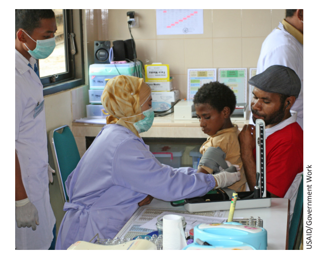
Staff at the Jayapura Health Laboratory in Indonesia—which received support from USAID to renovate and upgrade its laboratory facilities—examines a patient.

It is also important to note that most agencies did not identify duplications in US global health R&D. A few noted that programs within their agencies were complementary and that overlap can help in filling gaps as long as there is coordination.